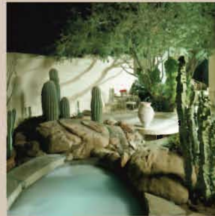
LOCATION: Biltmore, AZ