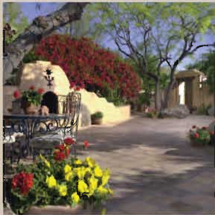
LOCATION: Paradise Valley, AZ