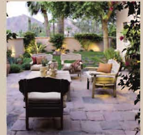
LOCATION: Paradise Valley, AZ