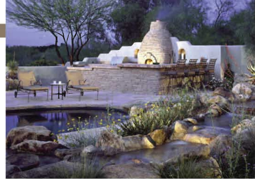
LOCATION: Paradise Valley, AZ

The restoration of a neglected 14-acre, 89-year-old garden we did in Montecito, California. In researching the site, we found historical photos archived in the National Garden Conservatory, which became the basis for the restoration. The project called for design through restraint and respect for the site's history.